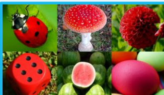
Machine Learning Game

Develop a Machine Learning model without software to identify and classify objects. Will you outperform your colleagues?